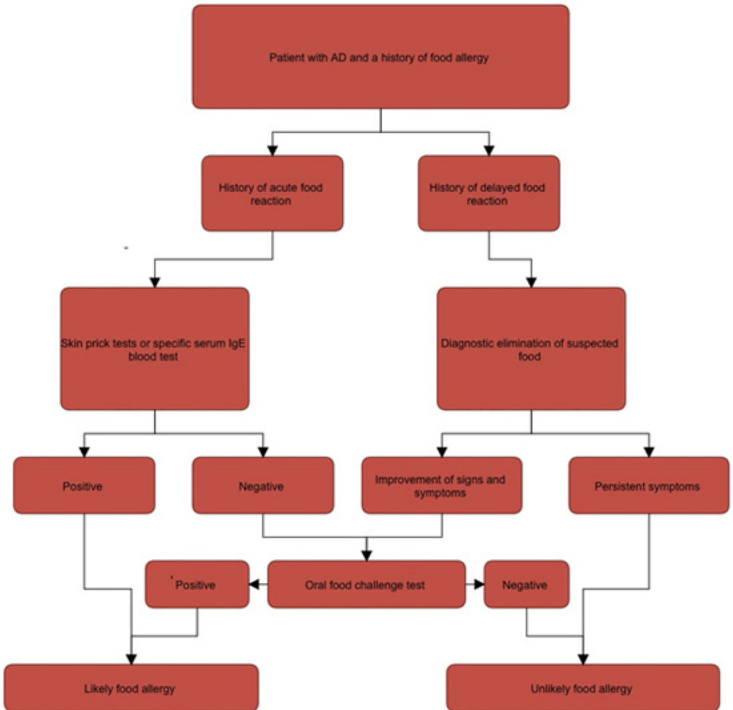
Proposed algorithm for the diagnosis of food allergy in patients with atopic dermatitis

We propose this algorithm to support the diagnosis of food allergies in patients with atopic dermatitis.