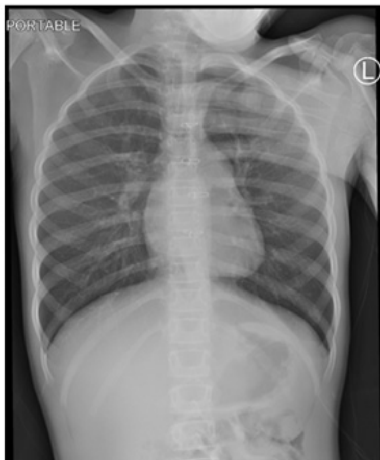
Figure 2: Chest x-ray in March 2023 (before treatment).